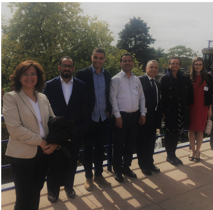
Visiting scholars at the network relaunch meeting at the University of Bath

"The MENASP network has never been more relevant than it is today"